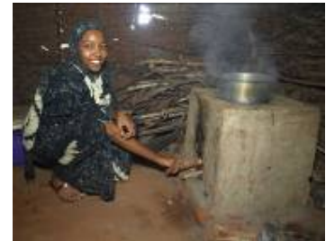
The stoves have social benefits as well as environmental ones

Each stove is individually tagged via GPS, in order to track the locations of all the stoves that are built. This provides reassurance to co2balance Kenya's clients that the stoves have been built and are in use, the coordinates of the stoves can be provided so that clients can view their stoves via Google Earth.